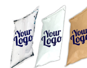
SPORT BASIC BIO